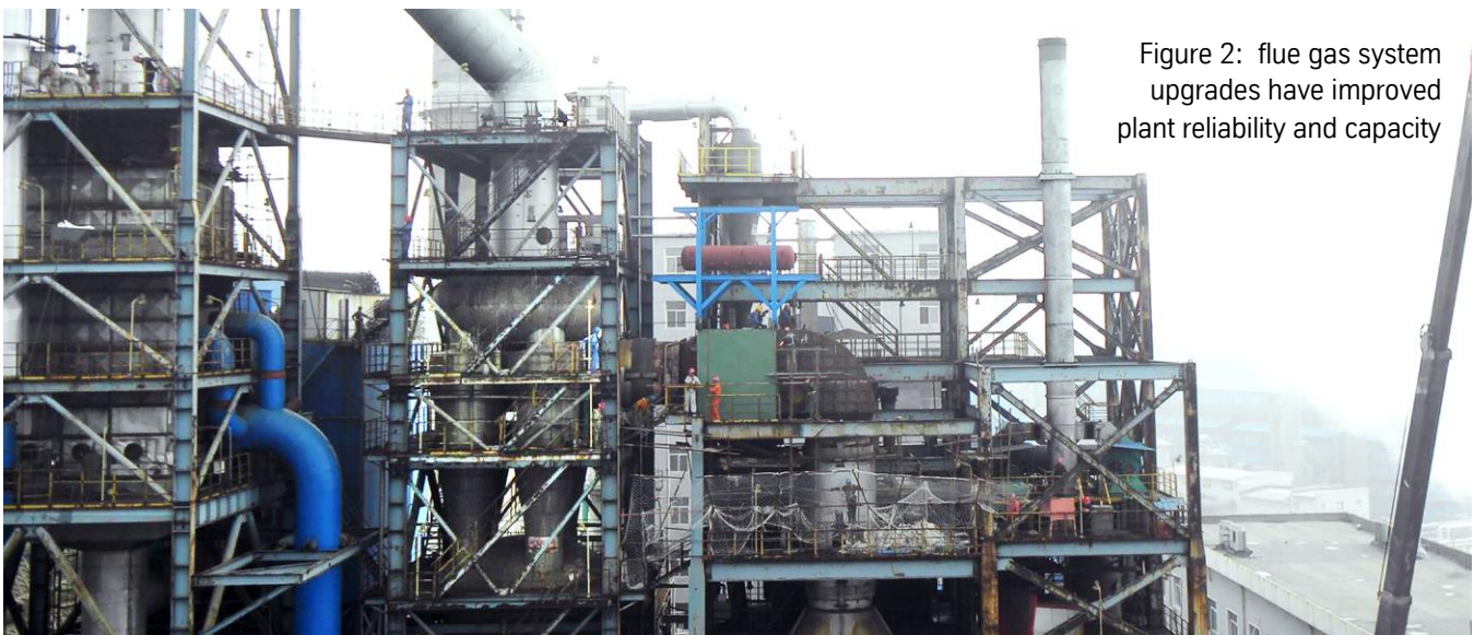
Figure 2: flue gas system upgrades have improved plant reliability and capacity